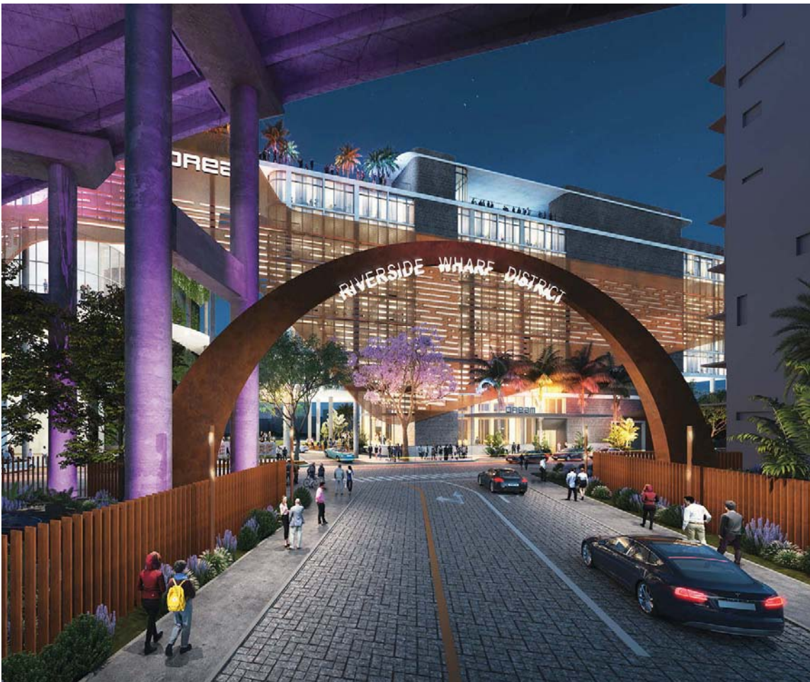
$185 million complex includes two 10-story towers, 165-room hotel, nightclub, event hall, restaurants.