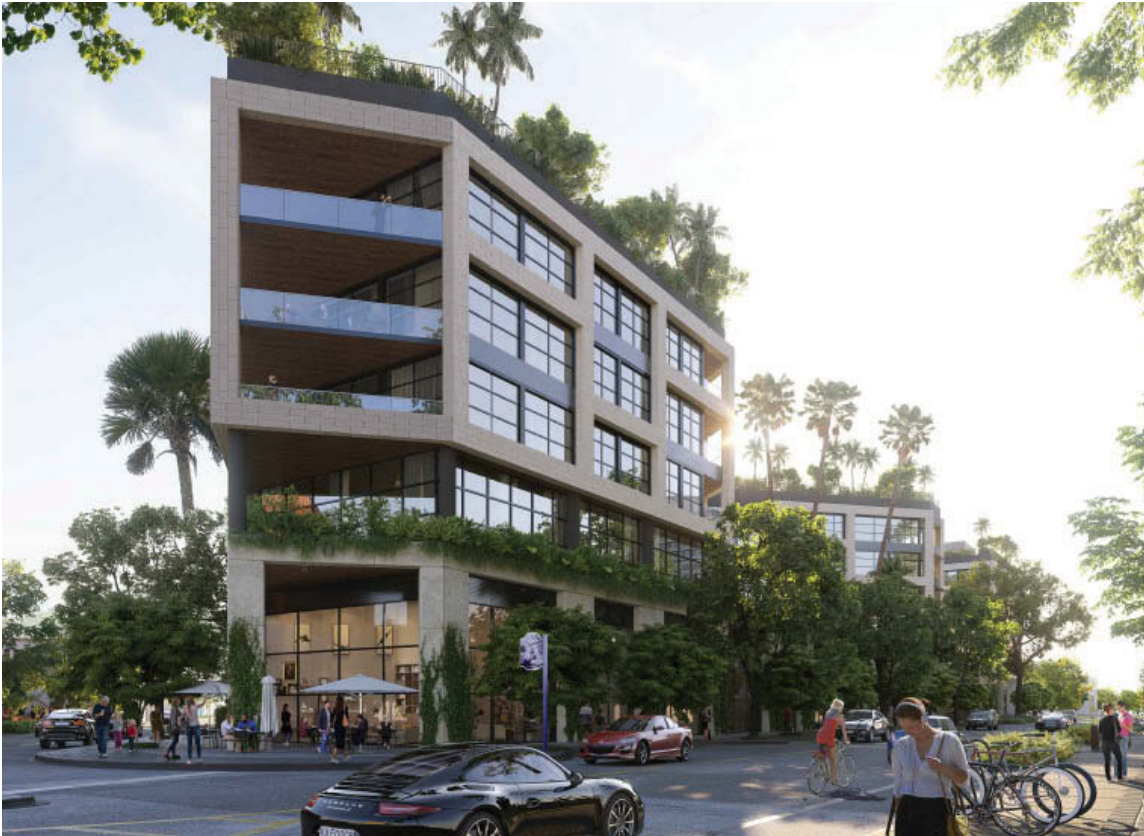
New mixed-use residential project with 174 dwellings will replace smaller hotel now on the property.

The property now has a three-story hotel.