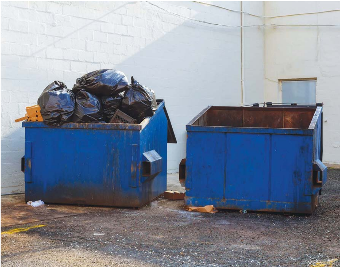
Contract on table would make Miami the nation’s first city to meter its waste with San Francisco firm.

Miami is known for setting trends, but the city’s latest innovation comes in a less glamorous arena than expected for the iconic metropolis: garbage. Don’t think of garbage as imagined in a grungy, avant-garde Art Basel exhibit, but rather the literal waste thrown in Miami’s dumpsters. In May, Miami commissioners unanimously approved the first reading of an ordinance to use waste metering, a technology that uses cameras to more accurately gauge how much waste the community produces. The goal is to modernize Miami’s recycling and reduce waste collection costs. If the proposal passes a second reading today (10/27), Miami is poised to become the first city in the country to meter waste with Compology, a San Francisco-based company. It’s a race against the clock to reduce waste in South Florida as landfills are reaching capacity. The North Dade landfill is made up of two cells, a 118-acre western cell that is closed and another 100-acre eastern cell that only has capacity through 2026. The 300-acre South Dade