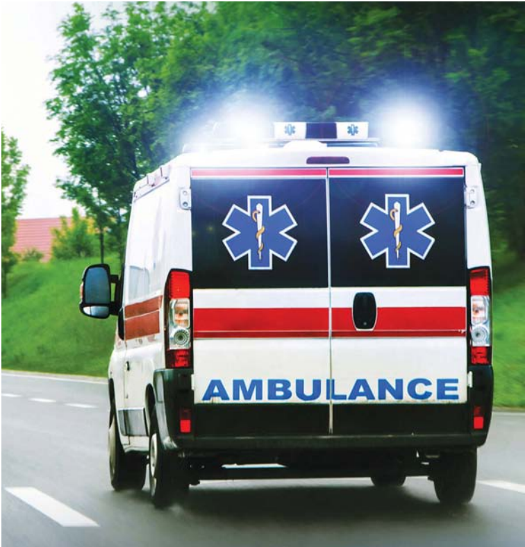
The increased rates remain well below those for county fire rescue.

The advanced life support ambulances carry a paramedic and an emergency medical