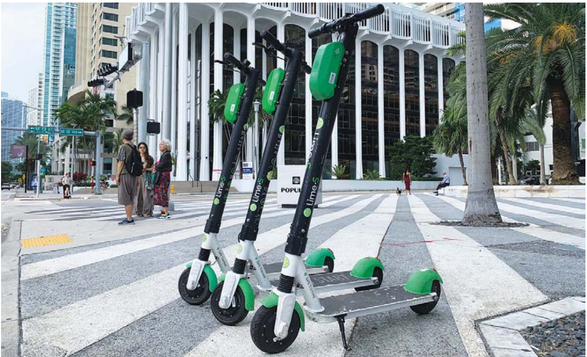
Groups of scooters have been common in Brickell and other areas. Proposal would curtail the number.