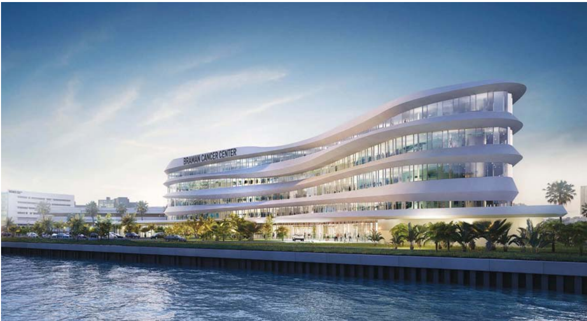
Mount Sinai’s Irma and Norman Braman Cancer Center is targeted to open its doors in September 2025.

Based on fluctuations in cost, construction and supplies, this step