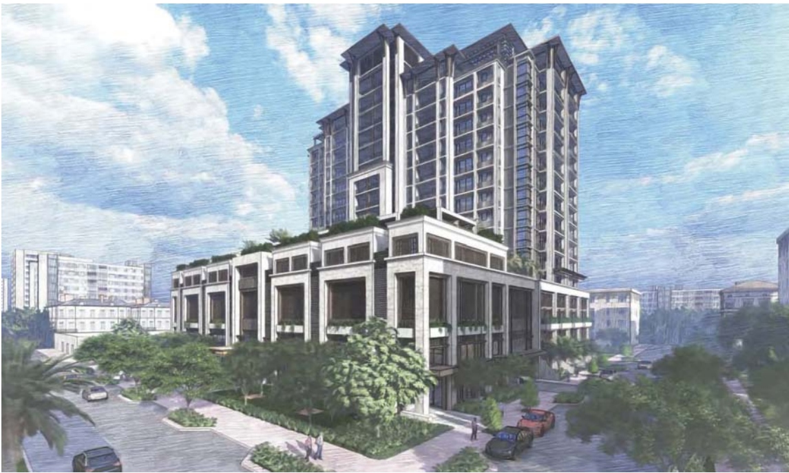
Development rights are being transferred from seven historic properties and two parks will be added.

“As you remember, there’s a lot to like about this project. It’s less than half of the maximum