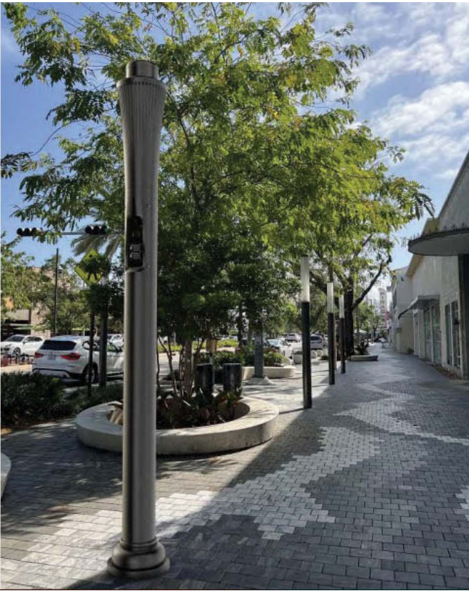
A so-called Twisted smart pole design was one of two that Gables commissioners picked on Tuesday.

Salzedo Street and Alhambra Circle. One smart city pole will also be installed on LeJeune Road and Alhambra Circle.