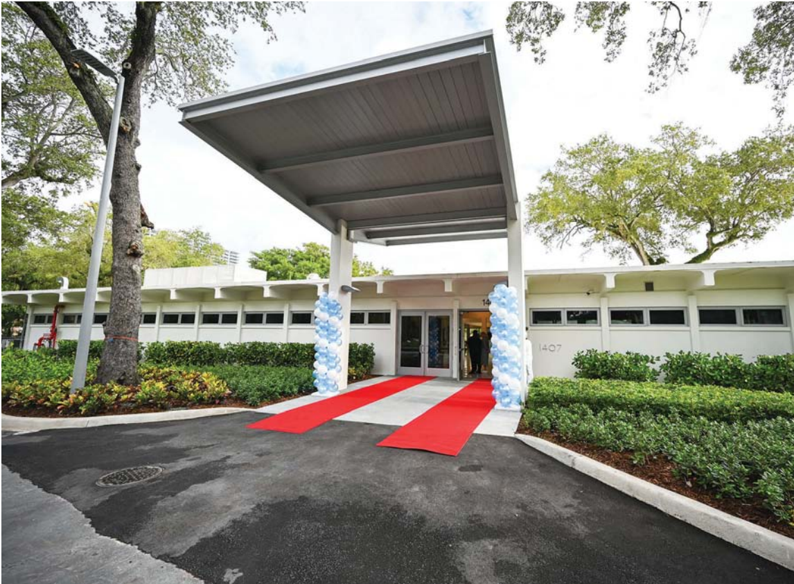
Robert King High Towers and Community Center reopened last week after it got complete renovation.

The Robert King High complex has three sections, about 100 housing units in each sec-